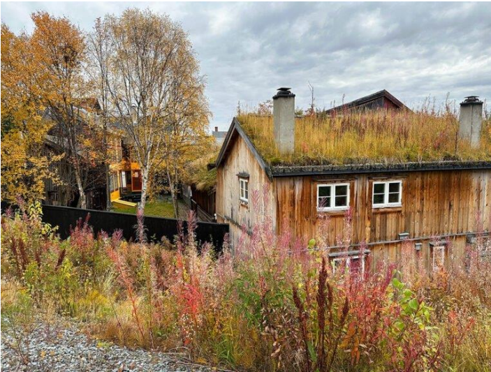
Behind Vertshuset Hotel in Røros.

Let's visit Røros this month. The traditional mountain village of Røros in Trøndelag is one of the oldest towns of wooden buildings in Europe and a UNESCO World Heritage site. Røros isn't known for its trees. In fact, the area surrounding the town is notoriously barren. Yet there is enough foliage in the town to get that autumn feel. This is especially true given the dark wood used in many of the older buildings.