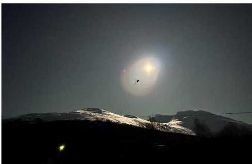
Moon over mountains in Troms.

November in Norway is characterized by a blend of late autumn hues and the first whispers of winter. In the south, the weather in Norway in November is cold, with temperatures typically ranging between -1°C and 4°C. The northern regions, on the other hand, witness a more dramatic shift.