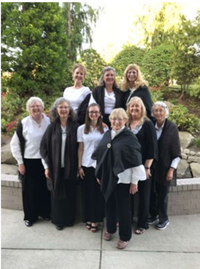
Women's' Scandinavian Choir