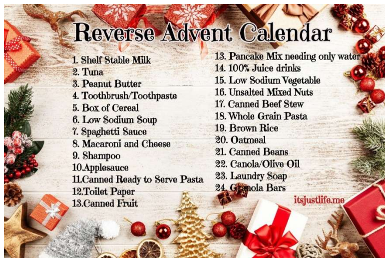
Remember to bring donations to the Edmonds Lodge Thanksgiving Dinner this 13 th of November.