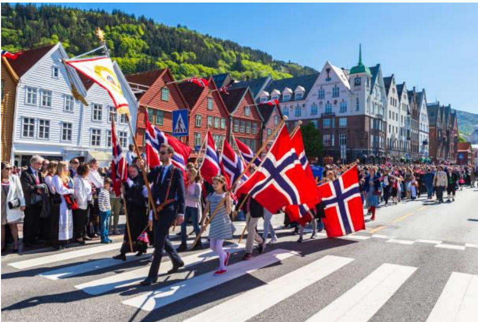
Bergen – 17 May 2018. Note the sun.

The weather can be pretty unpredictable, but it is likely Norwegians are hiking in the south of Norway and skiing in the north! We were never sure when I lived in Tromsø in the 1980s whether there would still be snow on the ground or not. However, now with climate change, it is not likely. Today, May 14 th , It has a high of 57 degrees and flood warning are out with rain predicted for the coming week. It looks like a wet 17 th of May in Tromsø. Hmm, Oslo is also 57 degrees with flood warnings! Bergen is 47 degrees with rain but no flood warnings. Tromsø is 1,080 miles north of Oslo (on the highway). Yes, weather is unpredictable in May.