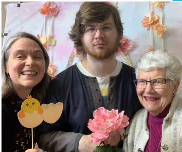
Fun at last Lodge Meeting