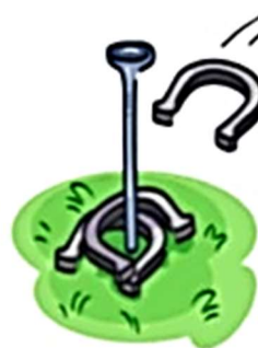
Illustration by Anne Lunde 2018