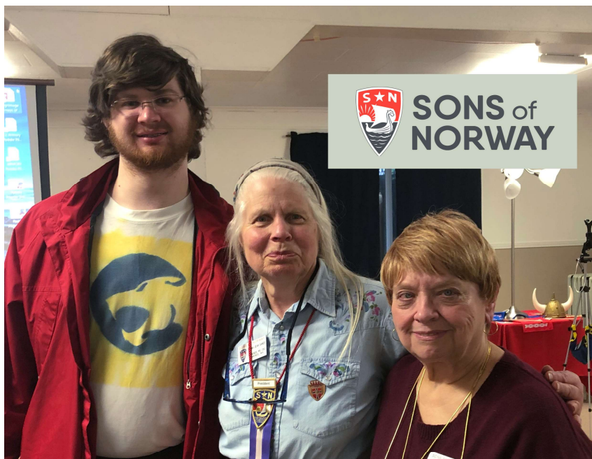
2018 Man and Woman of the Year